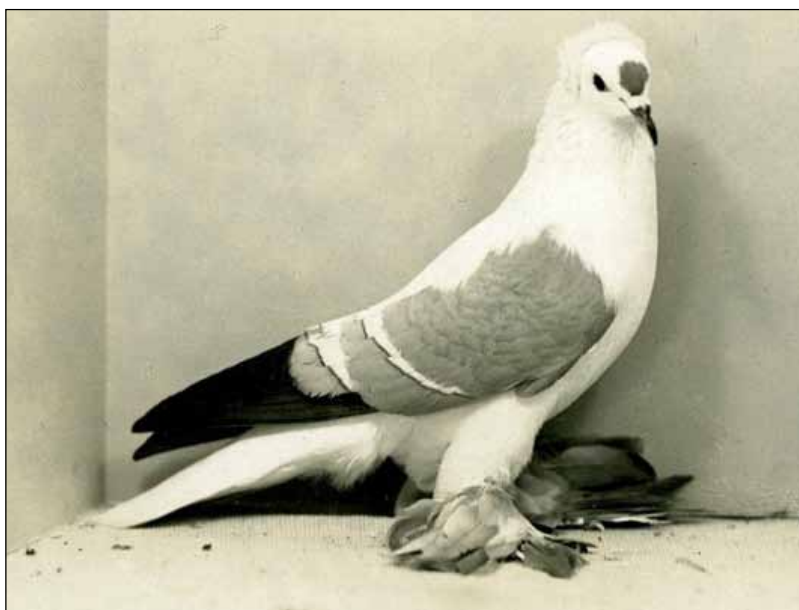
Blue White Bar Crested Saxon Wing Pigeon