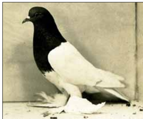
Saxon Breast Pigeon