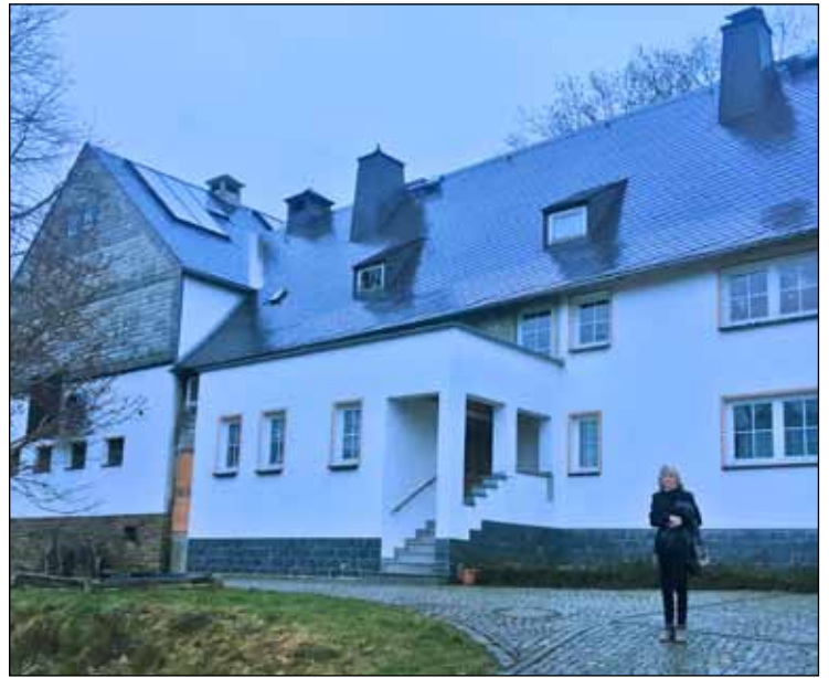
Cathy in front of our apartment in Homersdorf.

As the plane approached Denver and again that distinct sound of the plane's flaps echoed in the cabin we were eager for home yet pleasantly content with our experiences from our journey to Zwonitz.