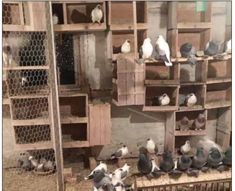
Gottard Einhorn's loft in Einsiedel