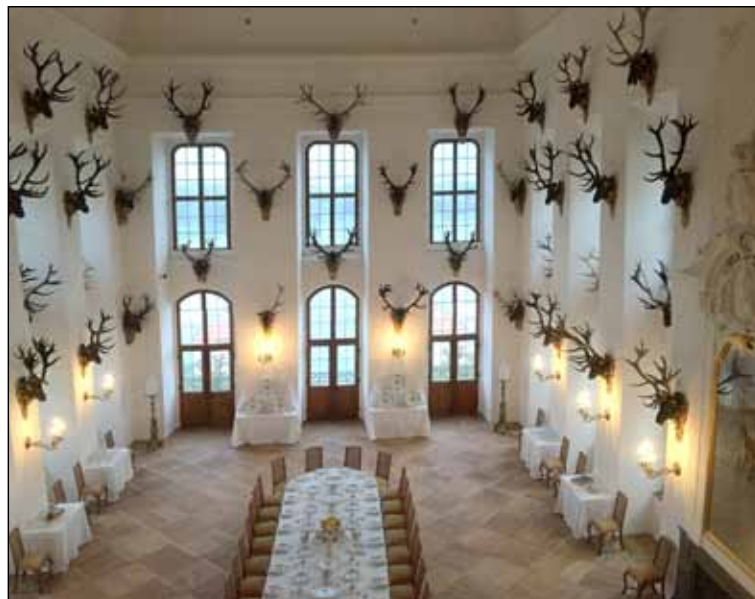
One of the dining rooms at the castle in Moritzburg