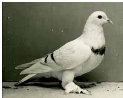
Saxon Moon Pigeon