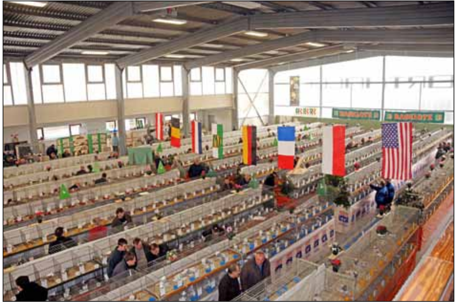
The Showroom at Zwönitz January 2016

Arriving at the showroom in Zwonitz provided a special treat of enormous proportions. Color pigeons everywhere and the breeds we so love. We have never seen so many ice pigeons in one location, what a visual treat. The variety was equally present in the Saxon Whitetails. We thoroughly enjoyed ourselves walking up one aisle and down the other. Over three thousand Saxon Color pigeons with the exception of the clean-leg ice pigeons shown in conjunction with the ice pigeon meet. It was challenging to absorb all that was there! While enjoying ourselves as we looked in awe from aisle to aisle we were delighted to renew friendships with exhibitors and judges in attendance. In the showroom it was clearly evident an enormous amount of thought, planning and presentation for the event had taken place. Flags representing the countries of the exhibitors were proudly displayed creating a special ambience and flare for those in attendance. Without a doubt the room was filled with loads of amazing birds and special friends, what fun. Everyone was so welcoming and so eager to make our time in Zwonitz special we were definitely indulged and spoiled.