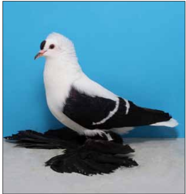
E-97 Black Fairy Swallow Zwönitz Show January 2016. Shown by Reiner Wolf