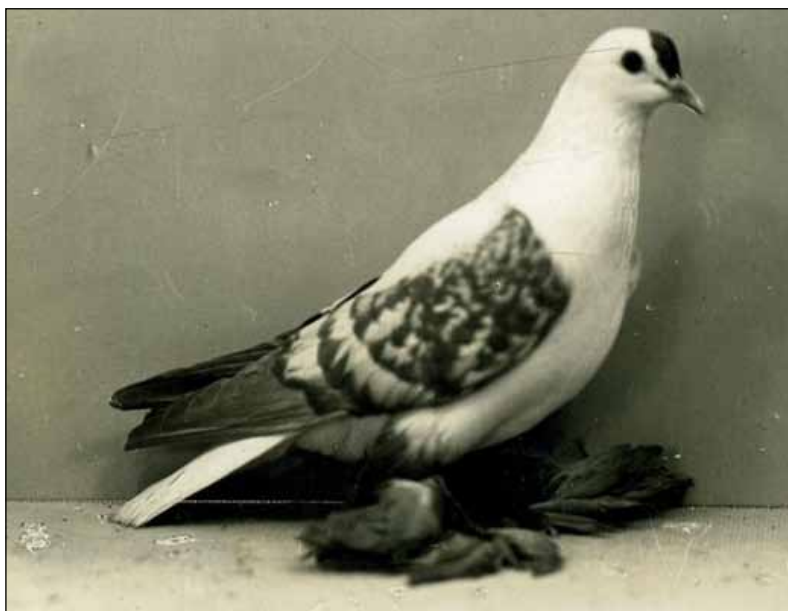
Yellow Spangle Plain-headed Wing Pigeon (Silesian Swallow)

When I looked at the photos it reminded that color pigeons have not changed much over the years. Medium, medium, medium then and now. What has changed is "refinement". Better color, better bars, better muff size and shape, etc. Thanks Thomas