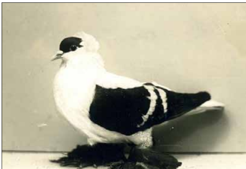
Red White bar Saxon Swallow